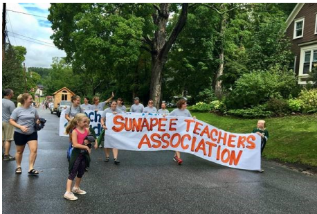
Sunapee Teachers marching with pride!