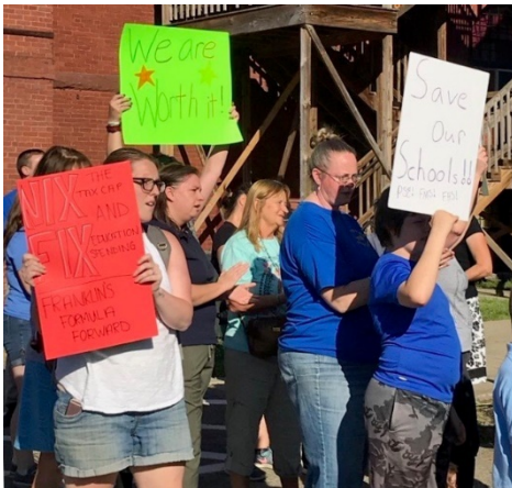
Franklin teachers, parents, students, school board and community members rally to stop drastic budget cuts and teacher layoffs in July.