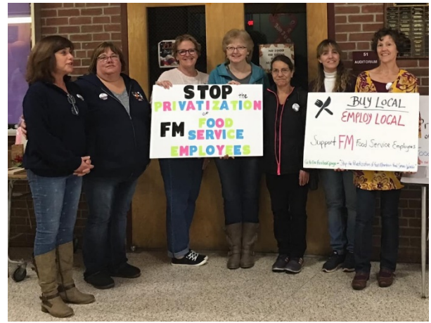
Food service employees and members of Fall Mountain ESSA rally to get signatures for their petition to stop privatization.